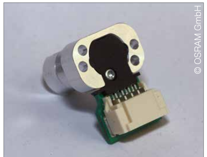
Application in miniaturized laser activated remote-phosphorus-device \mu LARP (laser light for cars)

Due to the thread-forming geometry of the EJOT® Micro Screws, inserts are unnecessary even for highly stressed components. Preparatory steps, such as thread cutting, which are especially difficult in the micro range can be omitted when using the EJOT® Micro Screws. Due to their individual thread geometries, adapted to the used materials, they are suitable for many different materials. They are also a good substitute for soldering, gluing, clipping or welding, because of their removability.